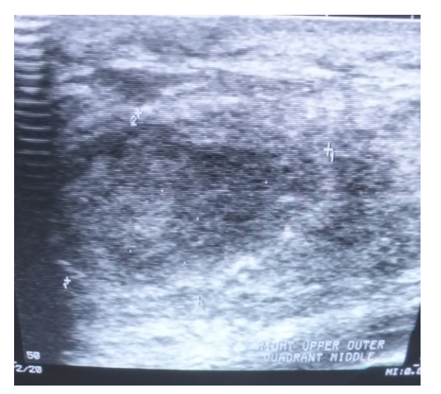
Fig 2. Ultrasound picture of the right breast abscess with thick wall.