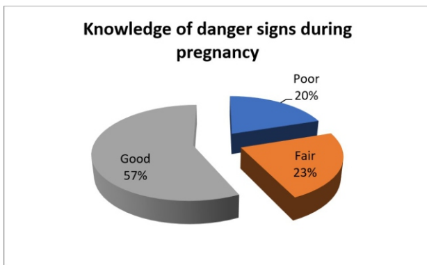
Figure 2: Overall Knowledge of danger signs during pregnancy among the respondents