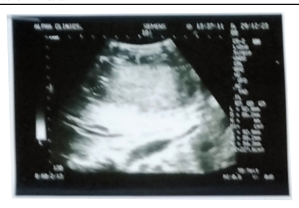
Figure 1: Ultrasound image showing the amoebic liver abscess

Amoebic liver abscess... Obiozor AA et al