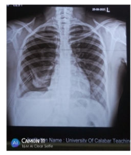
Fig 5: Catamenial Pneumothorax Pre and Post drainage