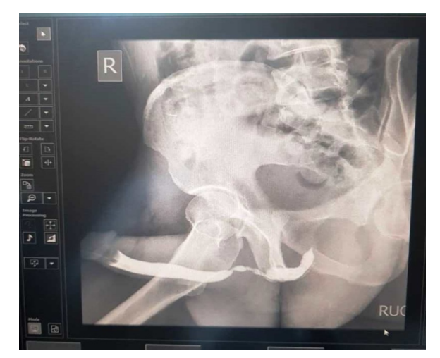
Figure 1: Long segment anterior urethral stricture on RUG

Statistical Analysis: The data analysis was done using statistical package for social sciences (SPSS) version 23 (SPSS Inc, IL, USA). At 95% confidence interval, P-value \leq 0.05 was considered statistically significant.