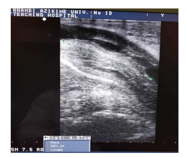
Figure 2: Sonogram showing long segment anterior urethral stricture