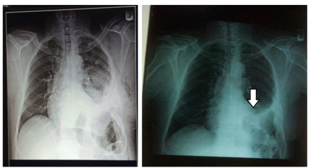
B: 4 weeks postoperative A: 48 hours postoperative Figure 3: Postoperative chest x-ray with white arrow pointing to the dome of left hemidiaphragm

His haematological, serological (retroviral screening, hepatitis B surface antigen) and biochemical parameters were normal. Chest x-ray showed a highly elevated left hemi-diaphragmatic dome. Diagnosis of eventration of diaphragm was made and he was counseled and told that the treatment would be surgical and he gave a written consent for preoperative work-up and left posterlateral thoracotomy. Intraoperatively, the left hemidiaphragm was found to be very thin (<0.5cm thick) without muscle; and displaced superiorly in the chest with the fundus reaching the third intercostal space and intraperitoneal organs residing in the 'chest' region. Subsequently, plication of the left hemi-diaphragm was done using polypropylene (prolene) mesh. This resulted in pushing the intraperitoneal organs down to the 'abdominal' region. See figure 3A. Postoperative course was uneventful. Postoperative chest x-ray revealed marked downward displacement of the elevated dome of the left hemidiaphragm. Since then, patient has been symptom free.