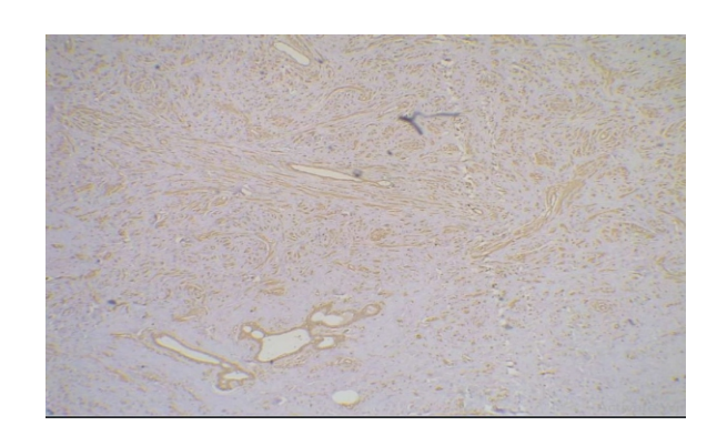
Figure 4: Photomicrograph showed immunoreactivity of the spindle cells for SMA by immunohistochemistry. (×4 magnification).