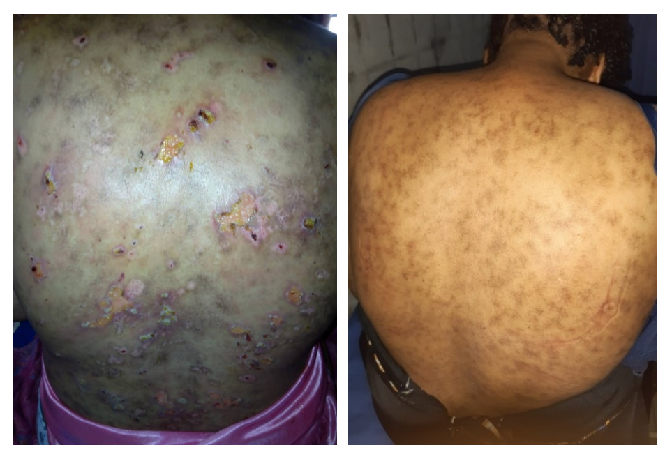
Figures 1 and 2: Pre and post-treatment bullous SLE