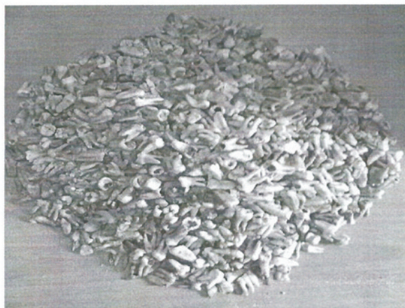
Fig 1.2,765 extracted teeth