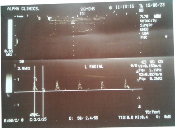
Figure 3: Reduced flow in the left radial artery

daily, losartan 50mg twice daily, digoxin 0.125mg daily, Aspirin 75mg daily, isosorbide dinitrate 10 mg three times a day, Frusemide 20 mg daily and Amlodipine 10mg daily.