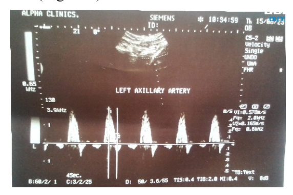
Figure 2: Echogenic deposits in axillary artery